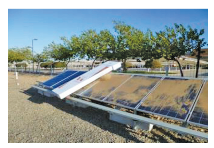
Fig.2: No water automated mechanical dusting device

The mechanical methods remove the dusts by brushing, blowing, vibrating and ultrasonic driving. The brushing methods clean the solar cell with something like the broom or brush, designed just like windscreen-wiper, that were driven by the automation. The blowing method cleaning the solar cell with wind power is an effective cleaning one as is shown in Fig.2.