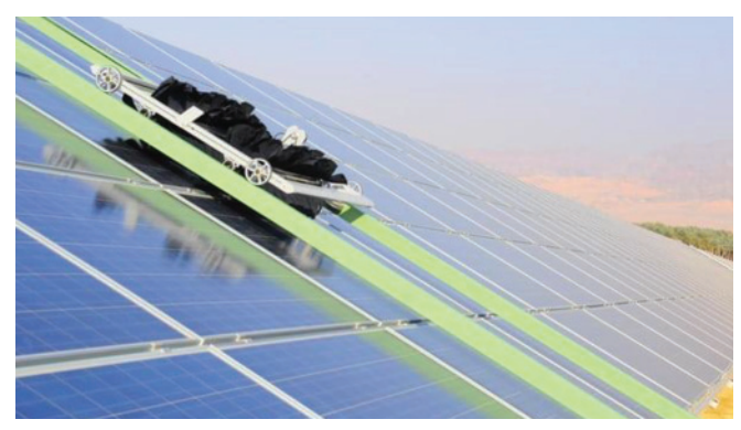
Fig.3: Robot for cleaning solar panels

Fully automated robots are mounted on a frame that moves laterally along the panels and the robots themselves move up and down the panels. The cost effective guiding rail system ensures that no pressure is applied to panel surfaces and the system translates smoothly across the array for the lifetime of the array. They use a rotating brush made up of soft microfiber in conjunction with air blowers to remove dust over the solar panels. This approach means that no water is required, also robots use their own solar panels energy shown in Fig.3. This method is cost effective, waterless operations, able to survive harsh conditions.