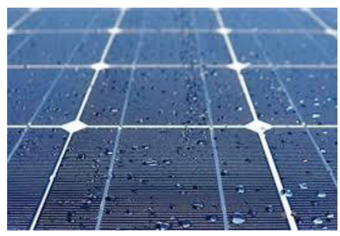
Fig.4: Nano coated solar cells

Solar panel located in desert area, water is a precious, energy intensive commodity, and is not always readily available. It must be transported, and more is always needed