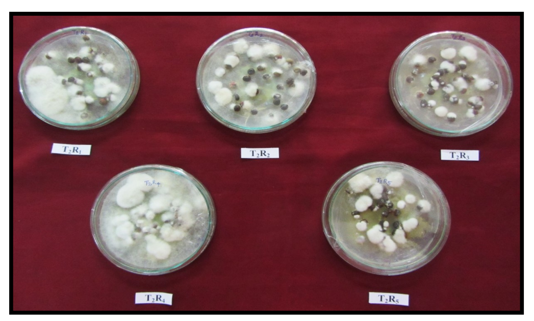
Figure 2b. Colony growth on treated seeds after 1 hour.