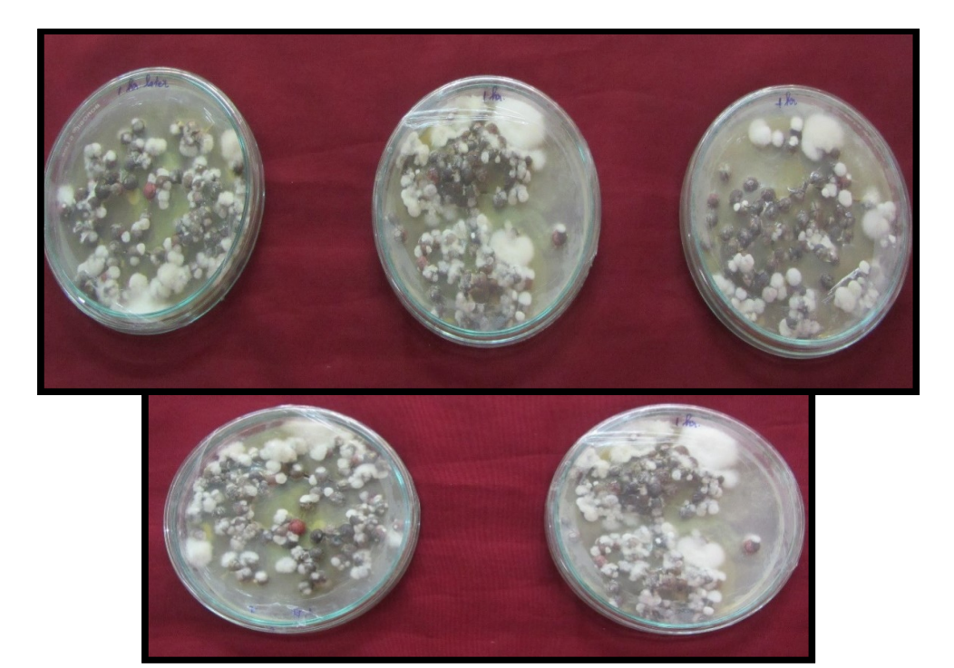
Figure 2a. Colony growth on treated seeds after 0 hour.