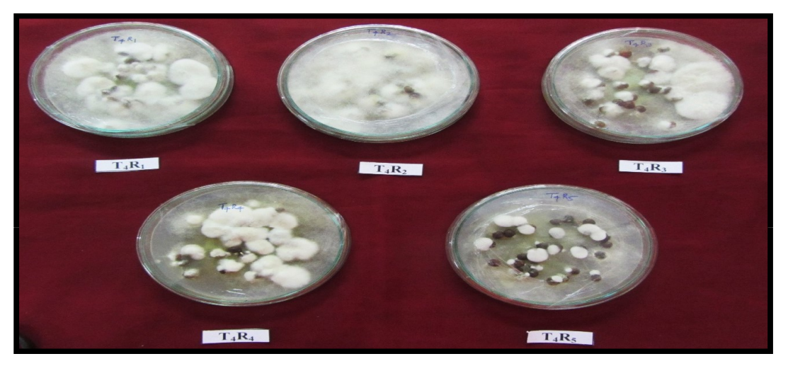
Figure 2d. Colony growth on treated seeds after 3 hours.