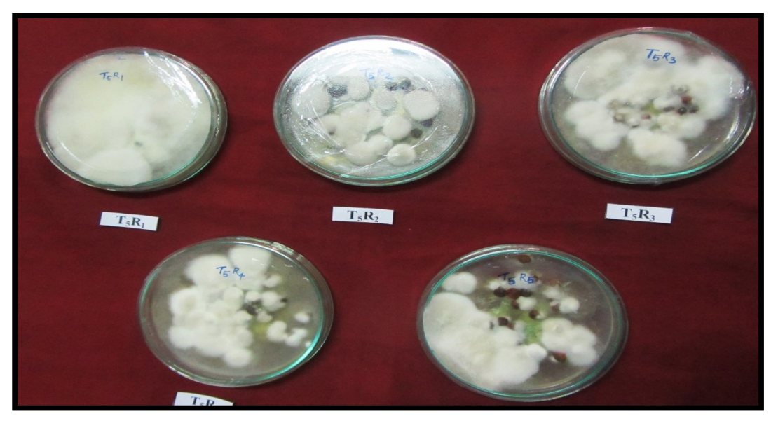
Figure 2e. Colony growth on treated seeds after 4 hours.

Figure 2. Studies on in vitro compatibility of imidacloprid 48% FS with Beauveria bassiana at different time interval of treatment (Colony growth).