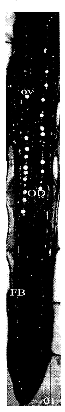
Fig. 1. Dissection of the female reproductive system of Ichthyophis tricolor . FB, fat body; OD, oviduct; OV, ovary.