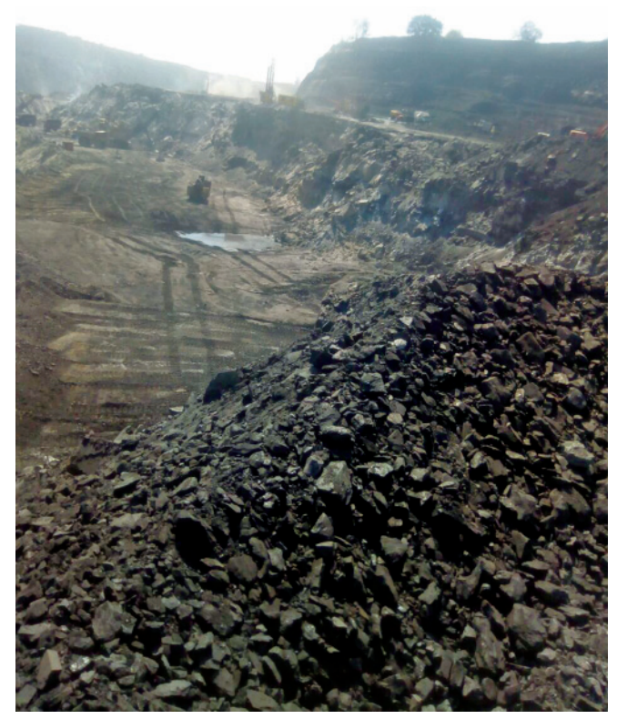
Fig.1 A working face at Piparwar mine, CCL (February 2018)

The mine had all potential to be an ideal case of sustainable mining model with land as an interim use exhibiting exemplary work on sustainable mining and inclusiveness restoring in-situ pattern of life sand livelihood of inhabitants as well as restoring the pristine ecology.