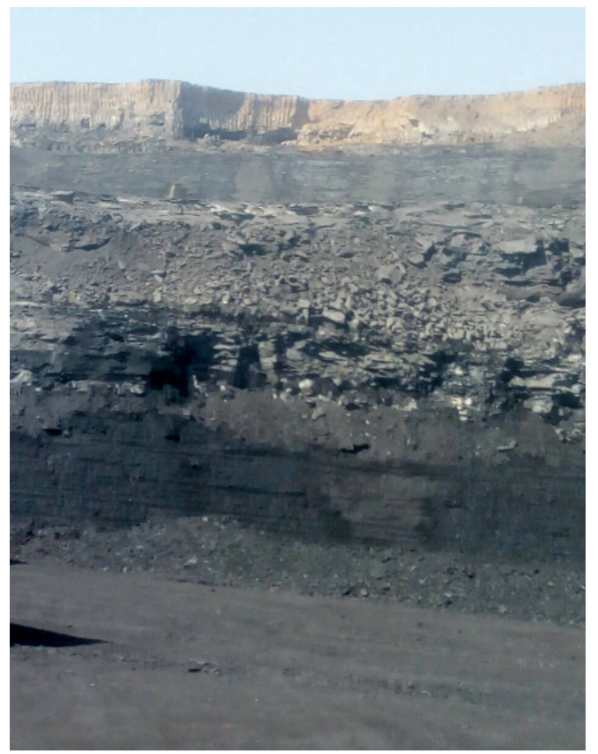
Fig.3 A shrinking working face at Piparwar mine (February 2018)

A few photographs of the mine have been taken recently and put hereunder to have a feel of the loss of opportunity of discovering inclusiveness in this particular case. The mine, though has been practicing backfilling in mine voids since beginning but the opportunity of restoring the ecosystems and bringing in inclusiveness for making growth sustainable has yet been lurking. And now it seems rather more difficult as the method of mining has been observed to be shifting from an integrated system to a flexible one customized to coal patch working.