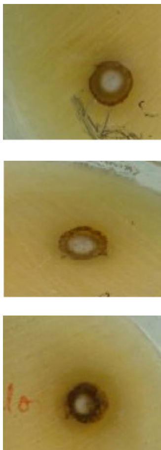
Fig. 5. Antidandruff activity of aqueous extract N.tabacum leaves against M.furfur .