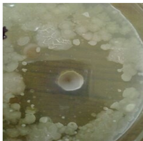
Fig. 4. Antidandruff activity of Ketoconazole against M.furur .