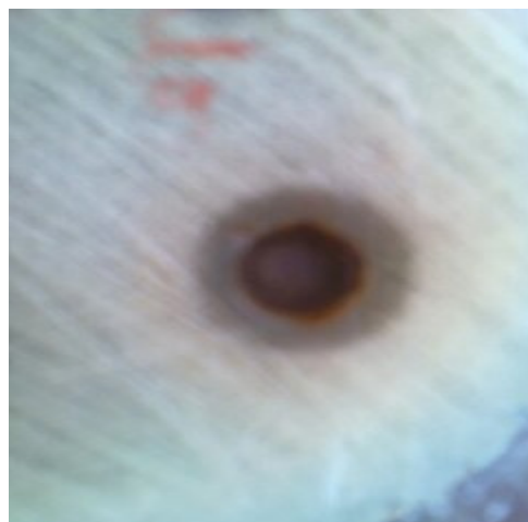
Fig. 2. 100 ppm material.