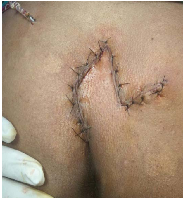
Figure 2. Post op picture of Limberg Flap.