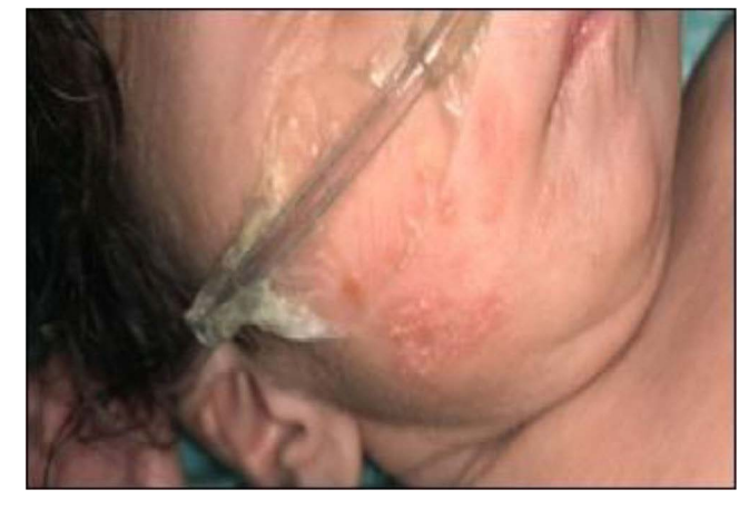
Figure 1. Few, well-defined, scaly plaques on the right cheek of the neonate.

Interestingly, on examining the father of the neonate, tinea corporis and cruris was noted (Figure 2). Other family members and caretakers handling the baby were also examined but no similar lesions were found in them.