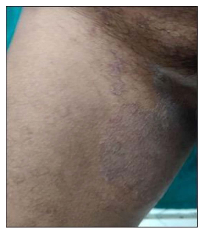
Figure 2. Tinea corporis and cruris in the father.

Other routine hematological investigations were within normal limits.