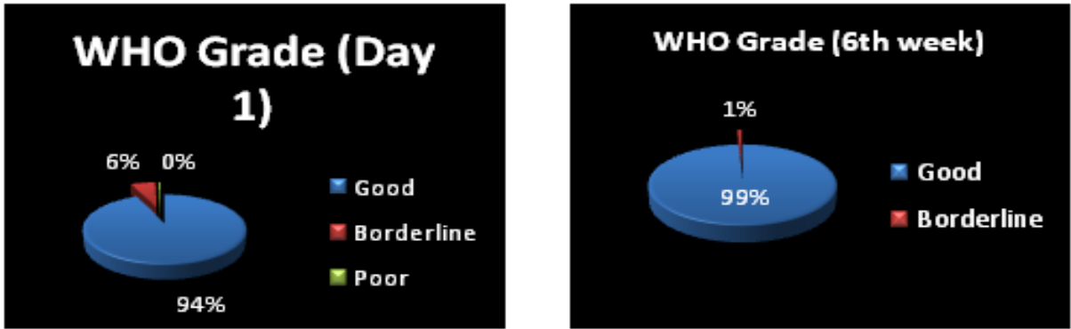
Figure 3. WHO grading for Visual outcome (UCVA Day 1 and BCVA at 6th week).