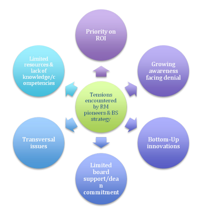
Figure 3: Tensions Encountered by RM Pioneers & BS Strategy.

As RM agents explained in the interviews, one of the important criteria to be a top BS in the FT' ranking is the value for money . This criterion evaluates the alumni salary three years after graduation against course costs. The length of the course is also taken into consideration<sup>4</sup>. As the ranking evaluates the placement success and the number of students