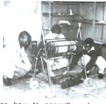
Learning how to correctly set up X-ray equipment.