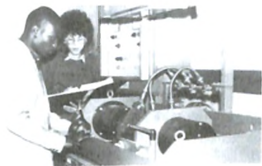
Students trained in NDT technologies

TRAINING FOR LIFE – A team effort between three national governments, industry bodies, national welding institutes and South African industry gives hope to new welding inspectors and a model for the future