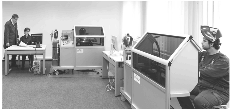
The GSI SLV Welding Trainer combines elements of hands-on education of welders and computer-based simulation to educate welders as realistically as possible

The company sees IIW as an ambassador of the welding trade in general, providing a forum where members can bring their local challenges and express them to an array of