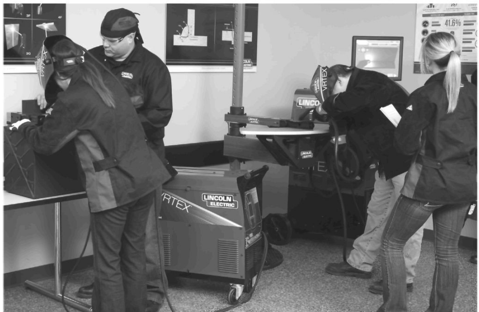
Training with the Lincoln VRTEX 360

Interested readers can get in touch with the experts directly via the contact details given below. IIW Member Societies are also disseminating information regarding the systems to facilitate assessment of their potential contributions to welder education and training around the world.