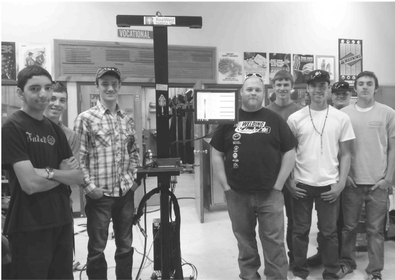
A welding class in the USA utilises the RealWeld Trainer to give real-time feedback on live welding using standard welding machines and procedures, as well as practice welding with the arc-off

minimal materials, spare parts, electrical power and personal protection and the education of welders is faster and more efficient.