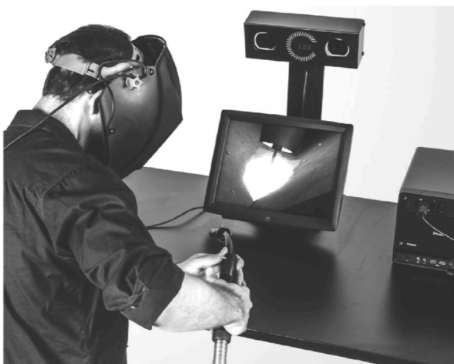
The ARC+ Welding Simulator is a training tool that powers lifelike virtual welding practice

The GSI SLV Welding Trainer combines elements of hands-on education of welders and computer-based simulation to educate welders as realistically as possible. Course participants learn basic welding techniques while handling a real arc with a minimum of amperage. All main parameters are monitored by camera and a computer-backed measuring system, and any irregularity immediately signalled to the welder. The use of the GSI SLV Welding Trainer requires