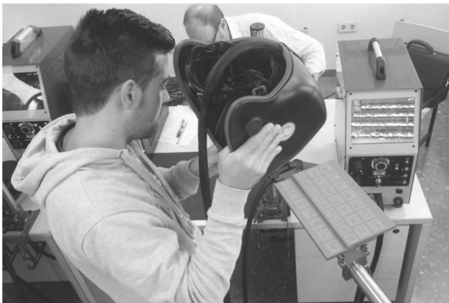
Soldamatic Augmented Training – not just a trainer-simulator for welding but a comprehensive educational solution

The platform includes teacher software for training management, cloud-based blended learning capabilities, student simulators incorporating augmented reality, and a