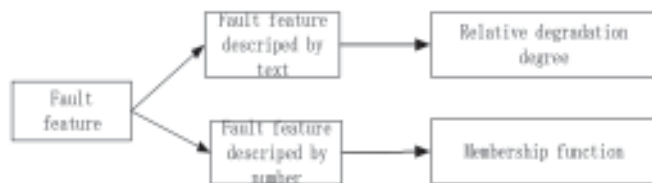
Fig.1 Classification and evaluation methods of fault characteristics

The analytic hierarchy process (AHP) is a method of multi-objective decision analysis put forward by T. L. Saaty in the 1970s[9-10]. The judgment matrix of AHP needs consistency check. If the consistency is unmatched, the judgment matrix needs to be established again. In actual judgment, however, the judgment matrix is adjusted using rough estimates. This adjustment features randomness, which needs more than one adjustment to satisfy the consistency check. To solve this problem, the improved AHP (IAHP) is put forward, which directly calculates the relative importance (weight) using the transfer matrix, to improve AHP in satisfying the consistency check.