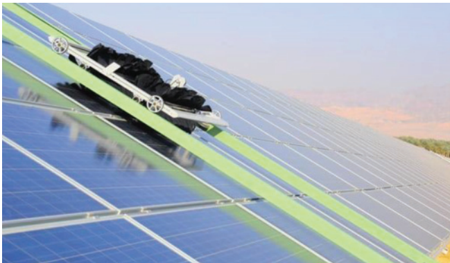
Fig.3: Robot for cleaning solar panels

Fully automated robots are mounted on a frame that moves laterally along the panels and the robots themselves move up and down the panels. The cost-effective guiding rail system ensures that no pressure is applied to panel surfaces and the system translates smoothly across the array for the lifetime of the array. They use a rotating brush made up of soft microfiber in conjunction with air blowers to remove dust over the solar panels. This approach means that no water is required, also robots use their own solar panels energy as shown in Fig.3. This method is cost-effective, waterless operations, able to survive harsh conditions.