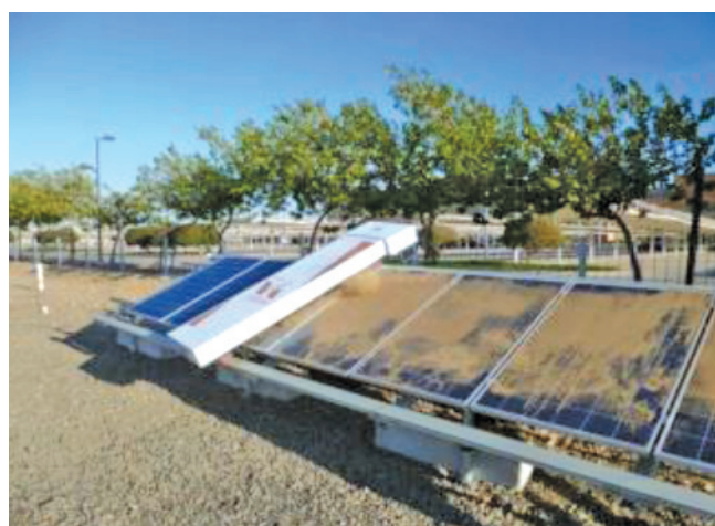
Fig.2: No water automated mechanical dusting device

The mechanical methods remove the dusts by brushing, blowing, vibrating and ultrasonic driving. The brushing methods clean the solar cell with something like the broom or brush, designed just like windscreen-wiper, that were driven by the automation. The blowing method cleaning the solar cell with wind power is an effective cleaning one shown in Fig.2.