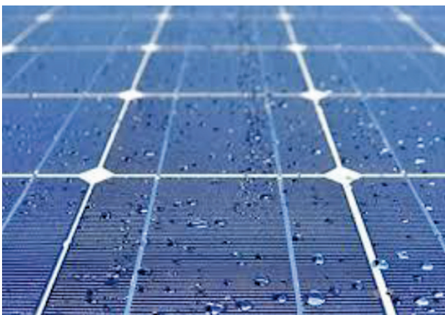
Fig.4: Nano coated solar cells

The principle behind a hydrophobic coating is that the layer forms a barrier so that water accumulates on the surface in an almost spherical shape, but is blocked from adhering to