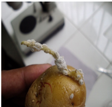
Fig. 2. Mummies of Phenacoccus solenopsis on a potato sprout.