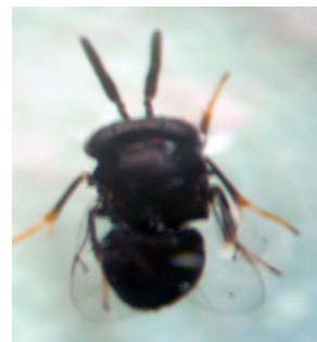
Fig. 4. Female of Aenasius arizonensis .

Biological parameters like developmental period, fecundity, longevity and per cent females in the progeny were used to construct the life tables for A. arizonensis as per the method worked out by Carey (1993).