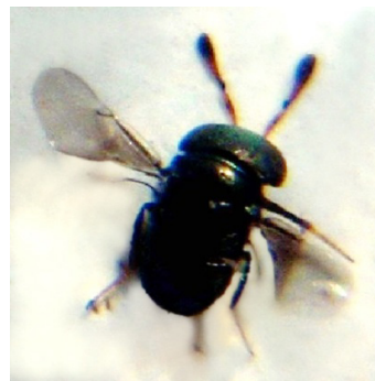
Fig. 3. Male of Aenasius arizonensis .

covered with a muslin cloth along with a streak of honey on the paper strip as a source of food. A sprouted potato infested with 50 third instar mealybugs was carefully placed in the jar for parasitization for the next 24 hours. After 24 hours, the parasitoid pair was removed and shifted to another new set of mealybug instars in a separate glass jar and the same procedure was repeated after every 24 hours until the death of the parasitoid female. The experiment was conducted at four constant temperatures of 20±1, 25±1, 30±1 and 35±1°C with 65±5 per cent relative humidity (R.H.). The constant temperatures were maintained in the B.O.D. incubator. The observations on different biological parameters were recorded on 15 pairs of parasitoids. Development period from oviposition to host mummy formation and from host mummy formation to adult emergence was recorded on 25 parasitized hosts at each temperature and total developmental period was also calculated. The other biological parameters observed were: pre-oviposition period, oviposition period, post-oviposition period, daily and total fecundity (number of parasitized hosts per female), male and female adult longevity and sex-ratio.