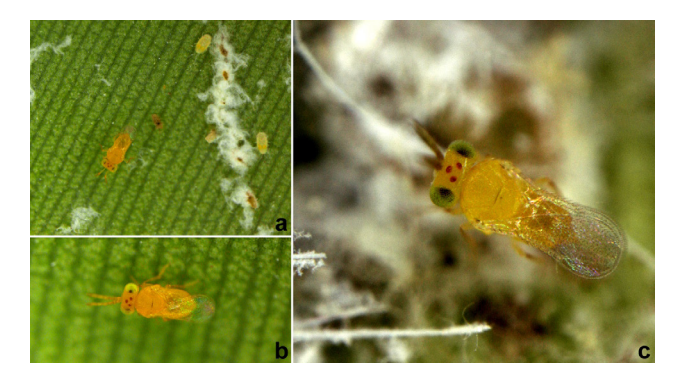
Fig. 1. Adult of Encarsia dispersa Polaszek on rugose whitefly infested banana.

Diagnosis: Both Encarsia dispersa and E. guadeloupae have a tarsal formula of 5-4-5 and belong to the luteola species-group (Hayat, 2011), with E. dispersa being a part of the Encarsia meritoria species-complex, a subgroup of the luteola-group (Polaszek et al., 2004). Females of Encarsia dispersa can be distinguished from E. guadeloupae by the following combination of characters: body more or less uniform orange-yellow except mesoscutal-scutellar transverse suture distinctly pigmented dark brown-black (Fig. 2a) in live and recently mounted specimens; antennal scape pale yellow to white, pedicel yellow, flagellum pale yellowish brown to brown, F6 usually darker than rest of flagellar segments. Wings hyaline. Legs, including coxae, yellowish except tarsal apices pale brown. Antennal formula 1133 (Fig. 2d, e), F1 shorter than pedicel and F2, F2 subequal to or only slightly longer than F3, rest of flagellum more or less subequal in length. Midlobe of mesoscutum with 12-15 setae (Fig. 2b); each side lobe with 3 setae; scutellar sensillae widely separated; distance between anterior pair of scutellar setae slightly greater than between posterior pair. Fore wing (Fig. 2c) about 2.3x as long as broad with marginal fringe less than one-fifth of wing width (modified from Hayat (2011) and Polaszek et al. (2004)). Hayat (2011) provided detailed descriptions of E. dispersa and E. guadeloupae with illustrations.