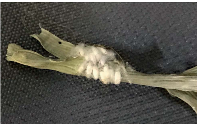
Fig. 3. Cotesia ruficrus cocoons collected from Spodoptera frugiperda larva in maize field (Karnataka).

the yellowish brown cocoons of A. narangae mentioned in Wilkinson (1928). However Wilkinson (1928) did mention that cocoons of A. sydneyensis were white in colour and cocoons of the Indian specimens were not observed.