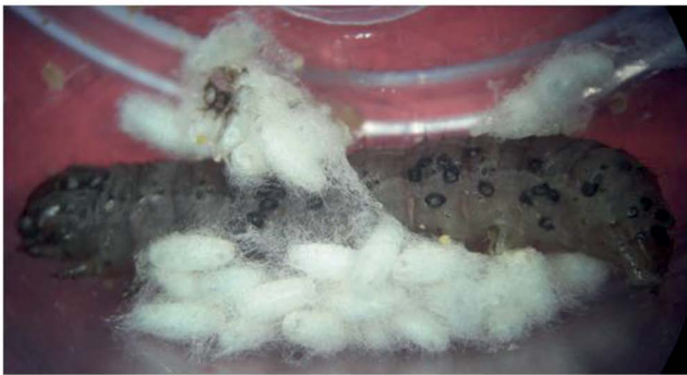
Fig. 2. Spodoptera frugiperda larva with Cotesia ruficrus cocoons in laboratory (Banswara).