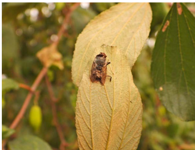
Fig. 1. Infected blow fly cadaver

The colony on SDYA medium is olive- dark green to dark brown, slightly greyish and reverse blackish. The