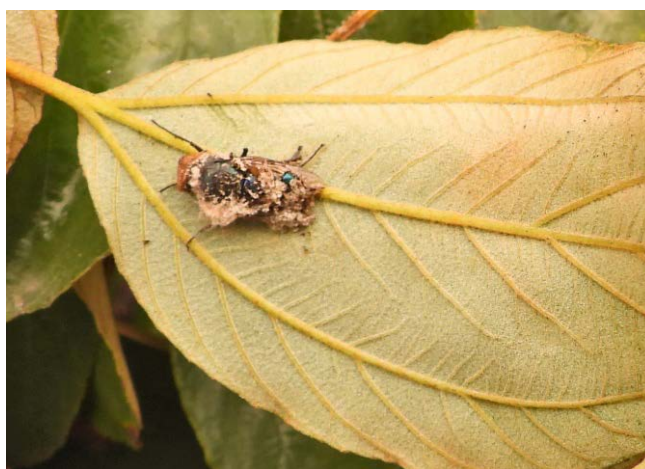
Fig. 2. Fungal mycelial growth on fly cadaver

colonies diffuse and the mycelia form mats and rarely grow upwards from the surface of the colony. In microscope, darkly-pigmented hyphae are sparse, unbranched or sparingly branched, wide, septate. Conidiophores are narrowly cylindrical to cylindrical-oblong, non-nodulose, unbranched or occasionally branched. Conidia are numerous, branches in all directions, small terminal conidia, sub-globose, ovoid-fusiform (Fig. 3).