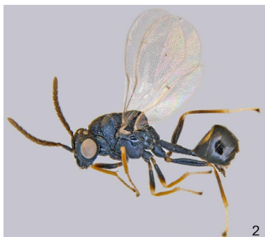
Fig. 2. Orasema initiator , male.

Comments. This species is closely related to O. assectator in general appearance, but can be distinguished from the latter by the distinctly shorter postmarginal vein, more elongate petiole, and the presence of dorsal and lateral keels on the petiole (Kerrich, 1963). Heraty (1994) has described both sexes of O. initiator with illustrations.