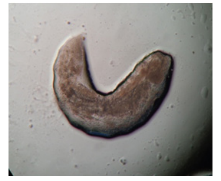
Fig. 4. Third instar larva.