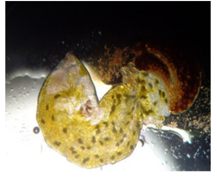
Fig. 6. Pupae.