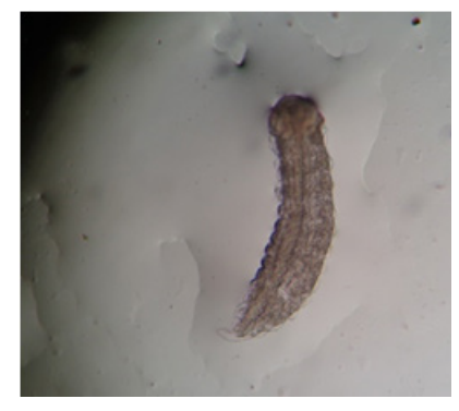
Fig. 2. First instar larva.