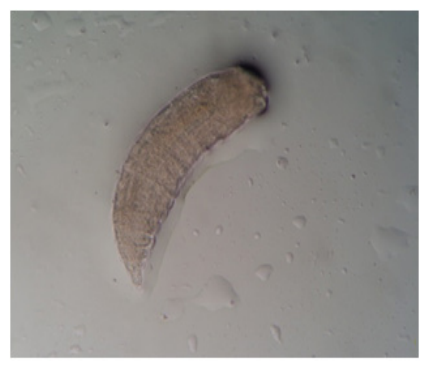
Fig. 3. Second instar larva.