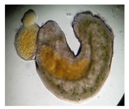
Fig. 5. Fourth instar larva of D. rapae .