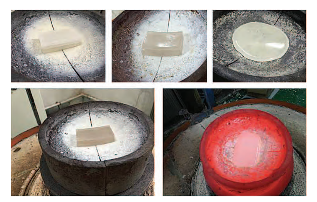
Fig.4 Finished product

Centrifugal casting of aspheric mirror requires a setting of an initial condition in which the initial condition in the annealing process are input to the model under study and the temperature at which the annealing is completed is set at 500°C. In order to study the stress state affected by annealing rate after the annealing, this thesis sets the annealing rate-1?/s, 1.5?/s, 2?/s, 2.5?/s and 3?/s respectively. In addition, the residual stress change of aspheric mirror after annealing under different parameters is also studied, as well as the annealing time affected by the annealing rate. Annealing time refers to the shortest time of even temperature distribution when the aspheric mirror shifts from the upper limit of the transition temperature to the lower limit (T1). The temperature range of the subject is 800°C, which aims at studying the centrifugal casting temperature, annealing retention and the influence of annealing rate on residual stress [11].