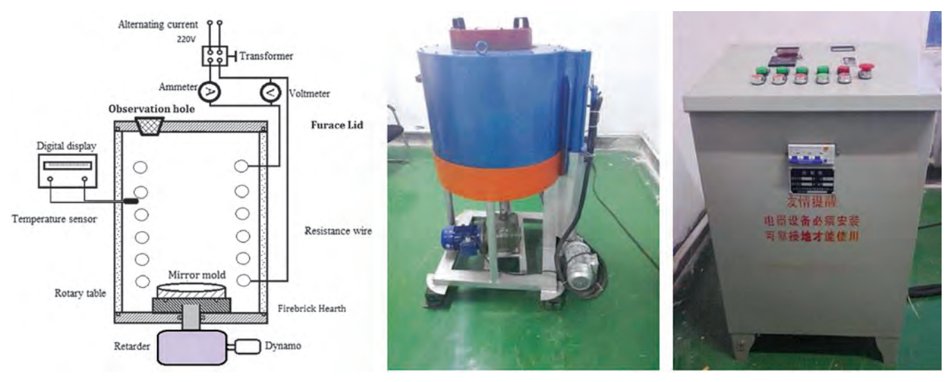
Fig.2 Centrifugal casting system and control cabinet