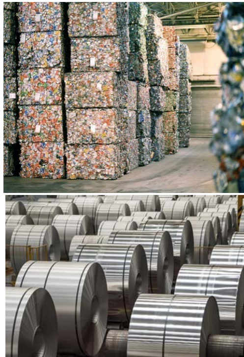
From cans to rolls

At its plant, die casting products that have been produced in the die casting plant and finished their life on the market, come back to have their life renewed as new material. The plant produces 3,000 tons of aluminum alloy ingots each month. Recycled ingots are widely used for die casting, foundry casting and sheet and extrusion at various customers.