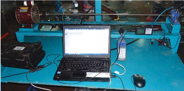
Fig.1: Journal bearing test rig

Journal bearing test rig (Fig.1) is designed and fabricated for investigating the experimental dynamic characteristics such as displacement, velocity, acceleration and noise. The test rig results have been verified with the theoretical results based on past research (Dinakaran and Ramesh, 2015).