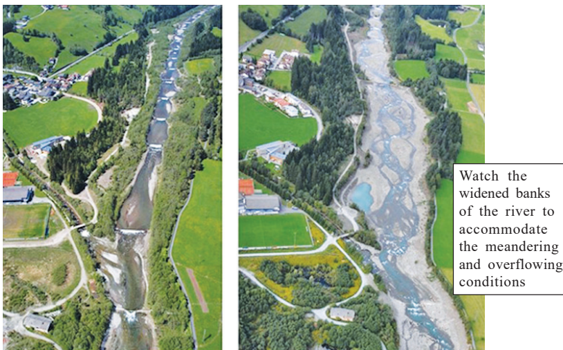
Fig.1: Example of river restoration through removal of grade-control structures along the Mareit River, Italy. View on the left is from 2005, prior to restoration. View on the right is from 2010, after restoration.

and recycling of sheet piling. They have also minimized the project's carbon dioxide emissions by using fossil-free fuels.