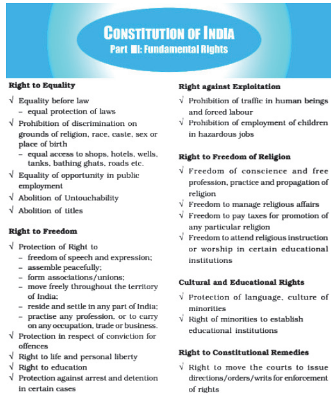
Fig.2: Fundamental rights of citizens in India