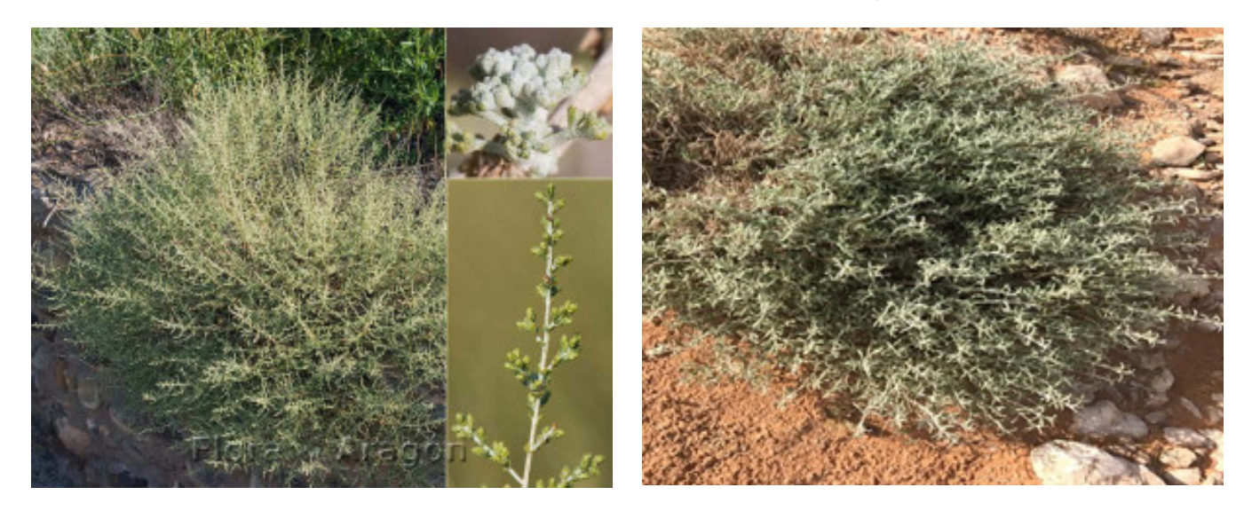
Fig. 1. The plants under study.