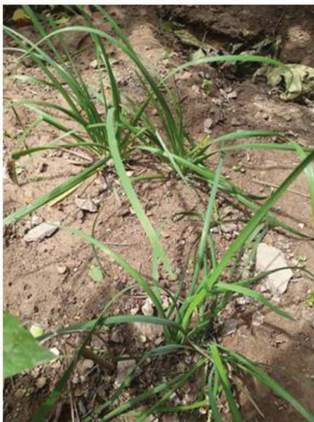
Figure 1. Photograph of Allium wallichii

past studies 29–30 . The plant was also revealed to contain carbohydrates, proteins fibre, fat, Ca, Cu, Fe, K, Mn, Rb, S, Si, Zn and vitamin C 31–33 . Pharmacologically plants have been studied for antimicrobial, anticancer, antioxidant and anti-inflammatory activities 11,27,28,32,34–38 . For a long, the plant is very useful and highly neglected during current research. Only few studies including pharmacognostic and phylogenetic have been carried out in past 7,10,39 . However, no any studies so far conducted for revealing the stomata type, stomata number and stomatal index. So herein, we studied and presented the study on stomata type, stomata number and stomatal index of A. wallichii leaves through quantitative microscopical method.