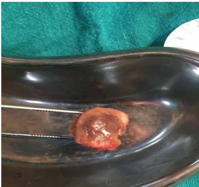
Figure 2. Wide local excision of the swelling.

During surgical procedure there is transplantation of endometrial or placental cells in the wound. This tissue is sensitive to hormonal changes. It is stimulated by estrogen which causes pain, swelling, tenderness, discharge which are typical symptoms of scar endometriosis 2,6,7,10 . Because of the variation of signs and symptoms, the diagnosis of scar endometriosis is often delayed. Cyclical changes in the size, intensity of pain during menstruation are classical for endometriosis, but only 20% of patient present with these symptoms 11 . Though implantation of endometrial cells occurs at the time of surgery, patient may present months or years after the surgery. The interval of 3 months to 10 years is reported in literature 12,13 .