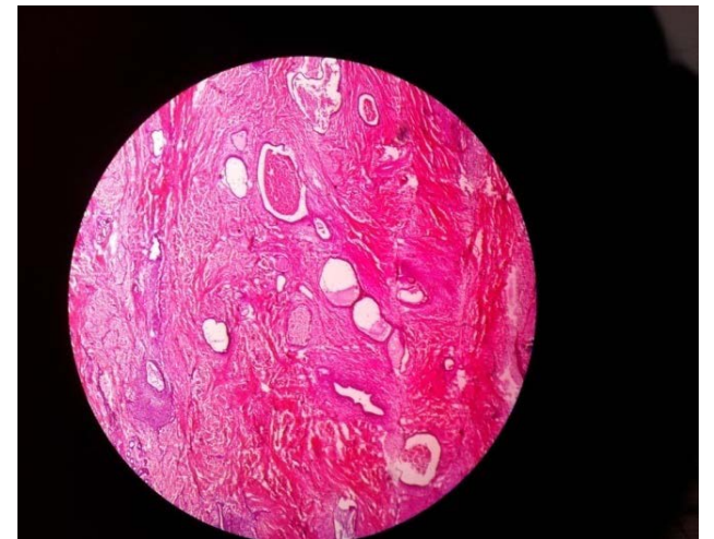
Figure 3. Histopathology- scar endometriosis.

The diagnosis can be done on ultrasound with color Doppler, CT scan and MRI, but these investigations lack in specificity 6 . Fine needle aspiration cytology is a quick, cost effective and accurate diagnostic tool but there are